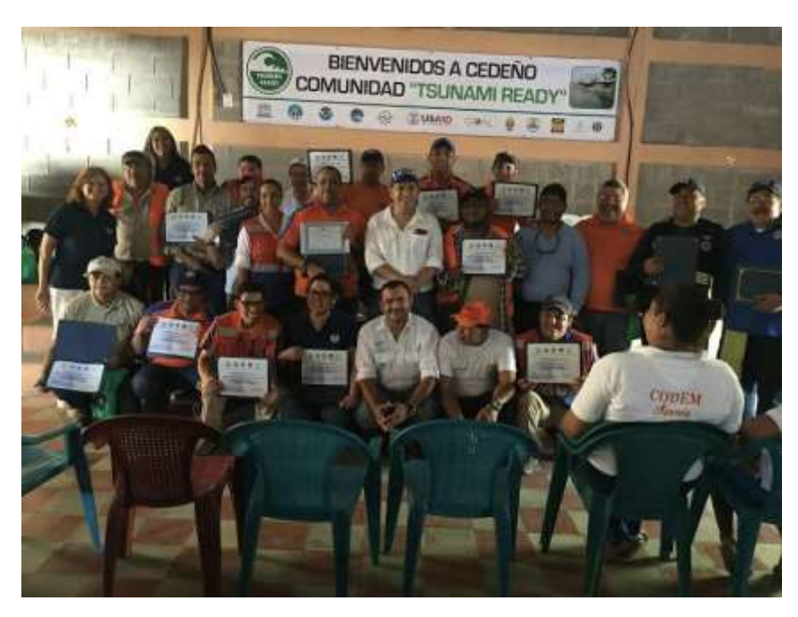
Figure 27. Tsunami ready recognition ceremony of the Cedeño community in Honduras.

It is important to consider that Tsunami Ready recognition is not a certification of readiness. Tsunami Ready recognition appreciates and acknowledges the community that has built their capacity and implemented measures in accordance with the agreed indicators of the Tsunami Ready Recognition Programme.