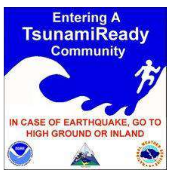
Figure 26. Entering a TsunamiReady® Community signboard in US.

The primary users of the Tsunami Ready Guidelines are local authorities of coastal communities at risk of tsunami impact, as well as representatives of Emergency Management Agencies or Disaster Management Offices working with coastal communities facing risk of tsunami impact.