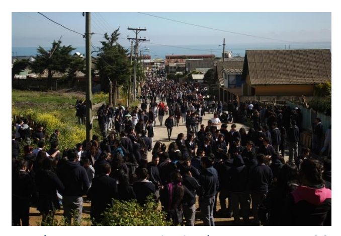
Simulacro Borde costero, provincia de cauquenes,2012

Prepare and train the community, as well as the staff of SINAPRED and SENAPRED, to face various socio-natural threats. Advise SINAPRED organizations on exercises coordinated by SENAPRED and/or their own training initiatives.